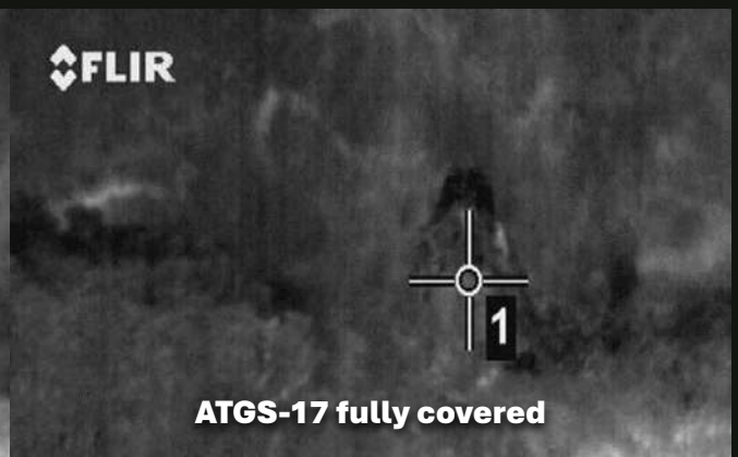
ATGS-17 fully covered