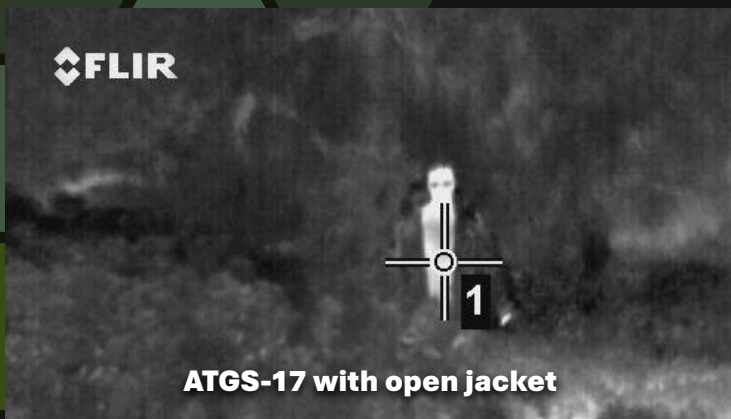
ATGS-17 with open jacket

Comparative Thermal Images White Hot (WHOT) & Black Hot (BHOT)