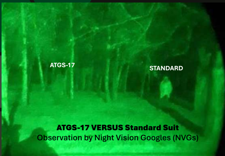
ATGS-17 STANDARD ATGS-17 VERSUS Standard Suit Observation by Night Vision Googles (NVGs)