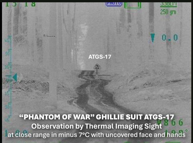
ATGS-17 "PHANTOM OF WAR" GHILLIE SUIT ATGS-17 Observation by Thermal Imaging Sight at close range in minus 7°C with uncovered face and hands