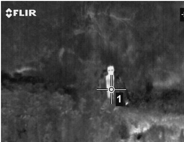
ATSS-11 with open jacket